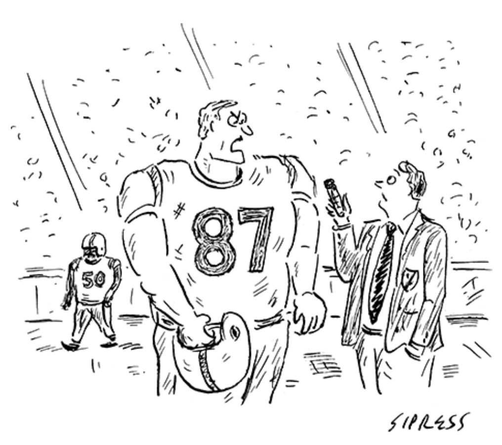
"First, I'd like to blame the Lord for causing us to lose today."